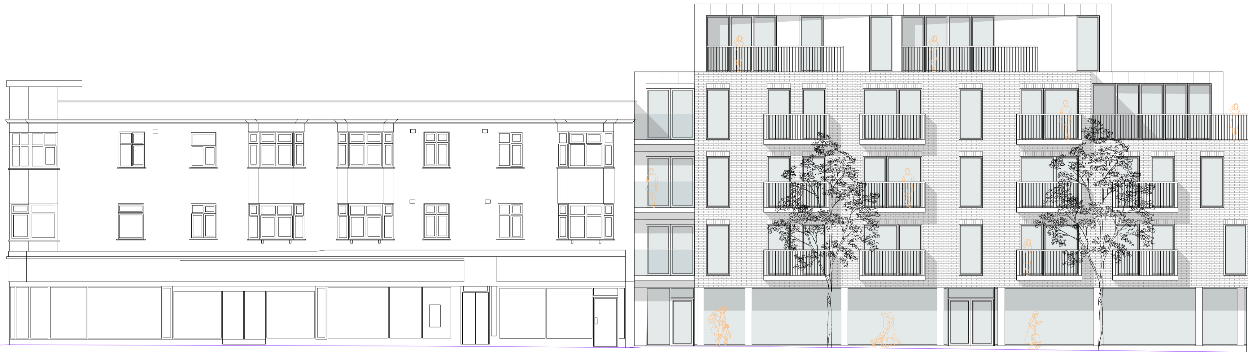
Proposed Front Elevation 1:100 0 1 2 3 4 5