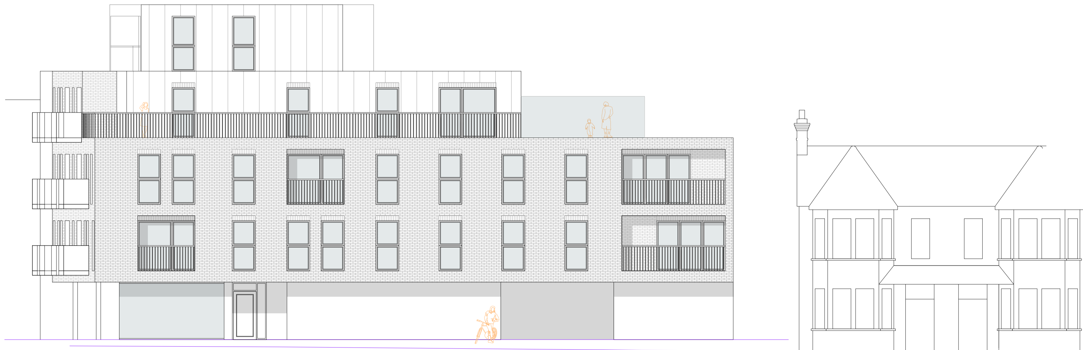
Proposed Fleetwood Elevation 1:100 0 1 2 3 4 5